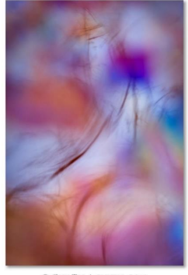
Winter Dream